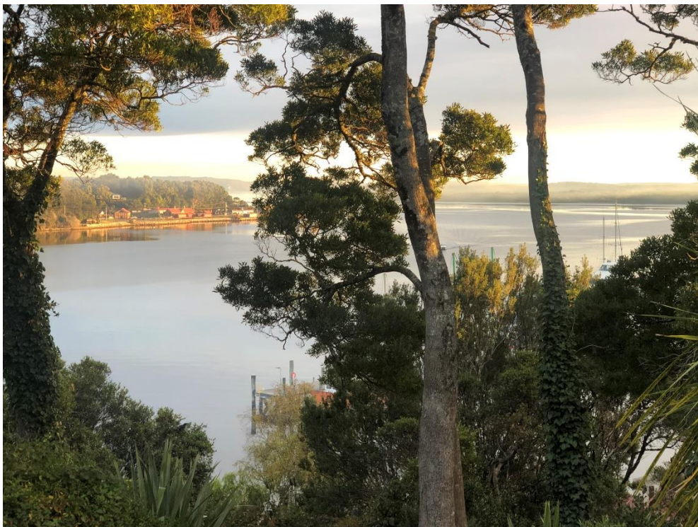
View from our Hotel Room in Strahan.