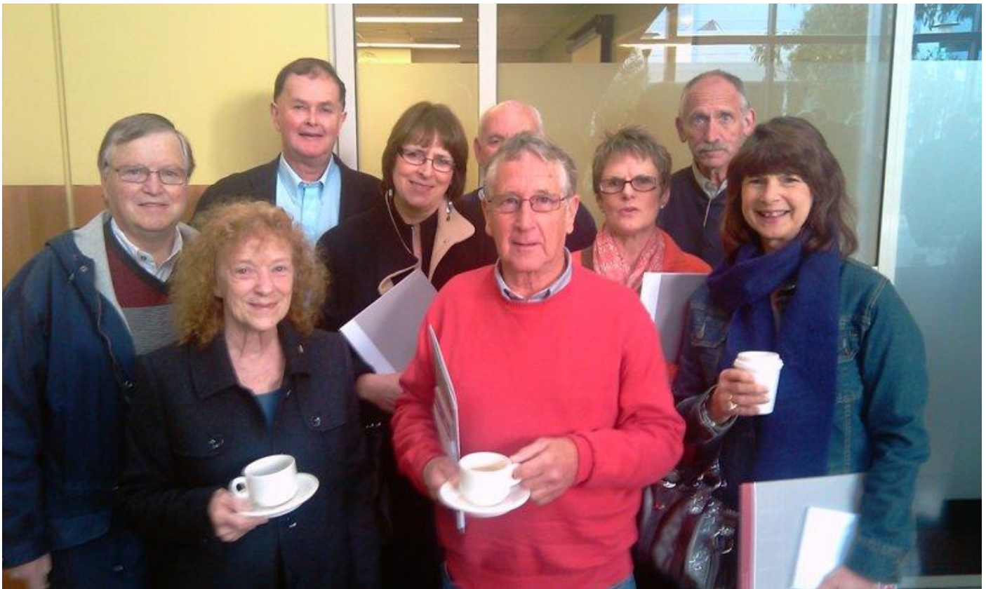
Around 2010-11. Maybe at Warrandyte High School?