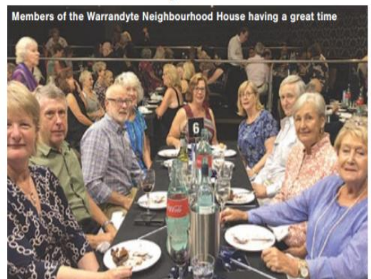
Members of the Warrandyte Neighbourhood House having a great time

Rotary is extremely grateful to the Australia Day Council for sponsoring the event, which enabled them to recognise so many amazing people in our community, and also to celebrate 100 years of Rotary in Australia.