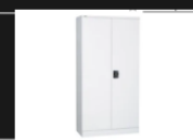
Sonic Metal Stationery 1800mm H Cupboard

Lockers and classroom storage will be needed