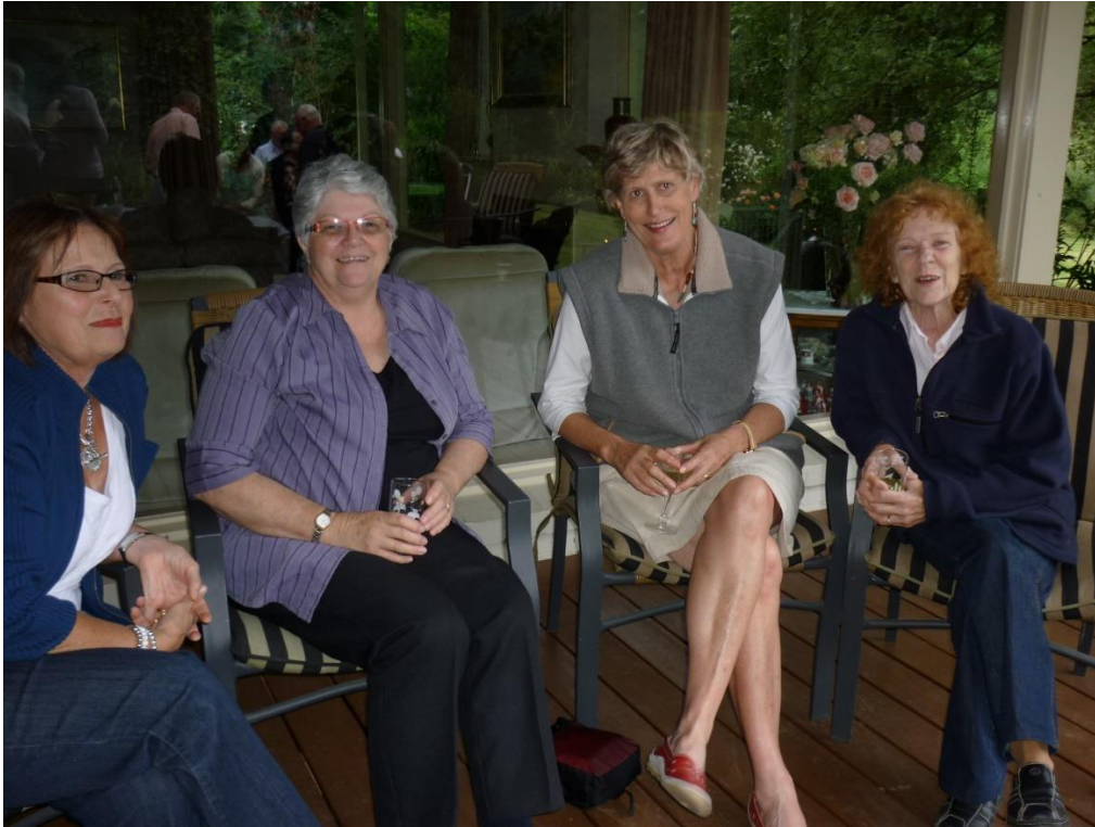
Summer BBQ at the Frys 2011.