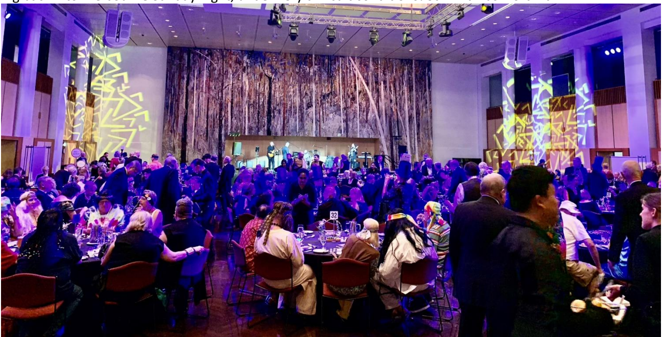
The Great Hall with the Arthur Boyd tapestry hanging on the front wall.