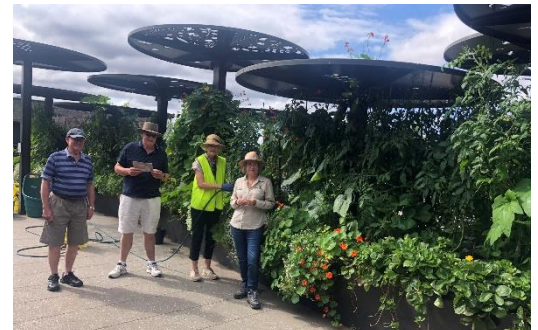
Arboretum Volunteers look after the flourishing kitchen garden. Below - a fabulous Bonsai collection.

Canberra was ablaze with the crepe myrtles featured below in the arboretum, and decorated many local streets to colourful effect.